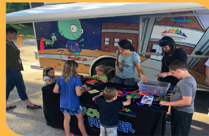
P.A.T. partnered with the Mid-Continent Public Library to host a Parking Lot Party!

P.A.T. is offered at no cost to all families in the West Platte School District. For more information, contact Parents as Teachers at pat@wpsd.net or 816-640-2811.