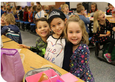
Elementary kids enjoy lunch time together!

The Web Store offers parents a convenient payment option from the comfort of their home or office, saving time and eliminating the need to send cash or checks with your student.