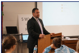
Volunteers present to high school students during Career Fair.