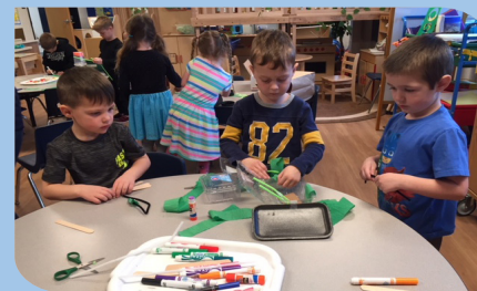
In March, preschool students worked on catching Leprechauns by making traps.

We look forward to seeing all of our Little Jays in August!