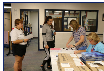
High school students during registration last year.