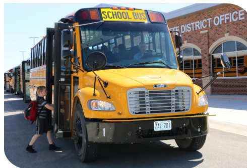
Students ride the bus after school.