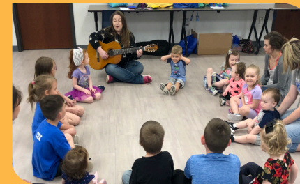
Family music night for students!