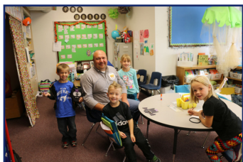
WATCH D.O.G.S. spend time with elementary kids.

To the world you may be one person, but to one person you may be the world. Volunteers are vital to the success of our wide range of programs. Volunteers help foster stronger school/community relationships by creating a common ownership in the success of our schools, as well as, demonstrating the importance of community service to our students. There are so many ways to get involved! Please visit our website to see the many opportunities! Below are a few suggestions!