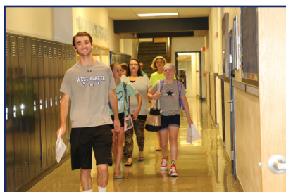
Students getting a school tour from one of our National Honor Society members.