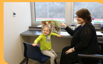
Developmental screenings took place for 3 and 4 year old kids at West Platte.