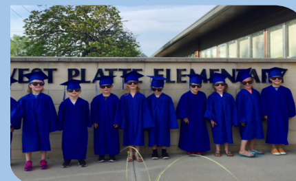
Little Jays graduate from preschool!